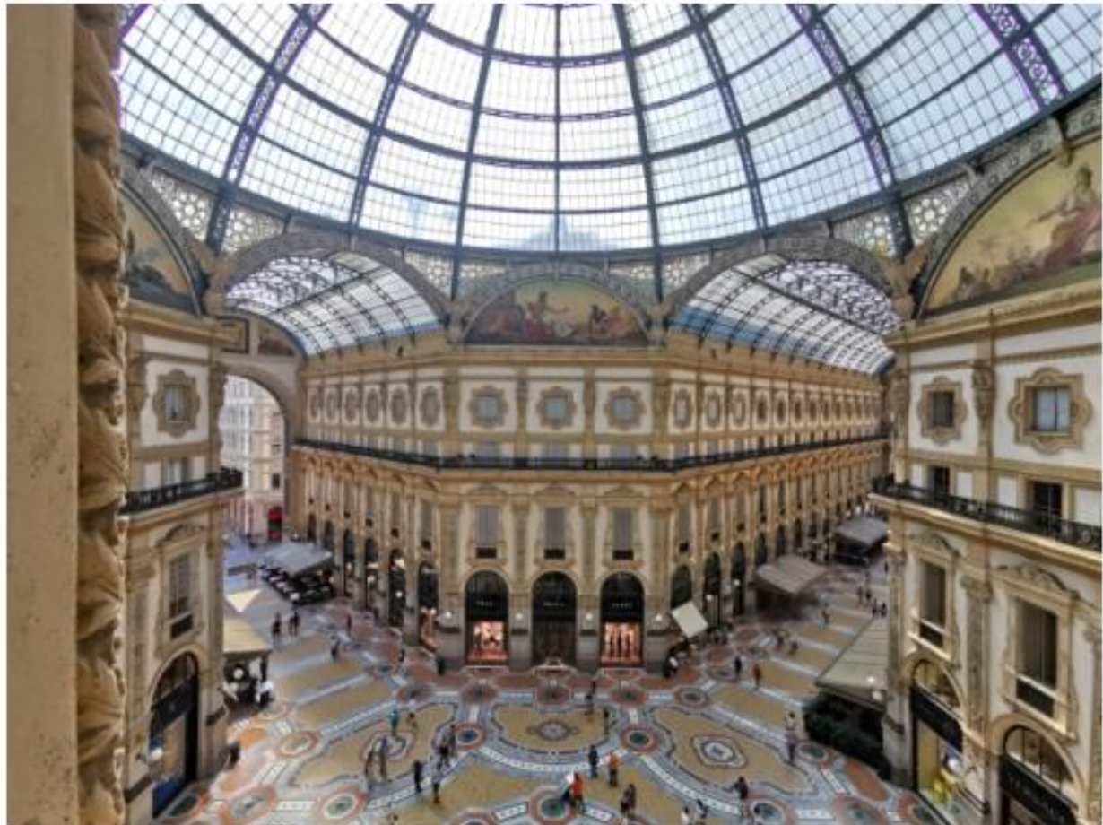
View of Galleria mall from the Vescovi room

But not only that, some suites feature balconies with impressive views of the mall's interior, allowing guests to relax with their Illy coffee from the in-room coffee machine while watching people mill about below.