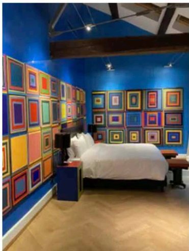
One of the hotel's Grand Terrace Rooms, completely covered with work from contemporary painter Fernando López Lage